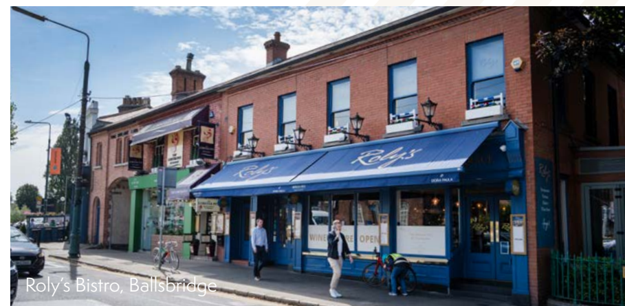
Roly's Bistro, Ballsbridge